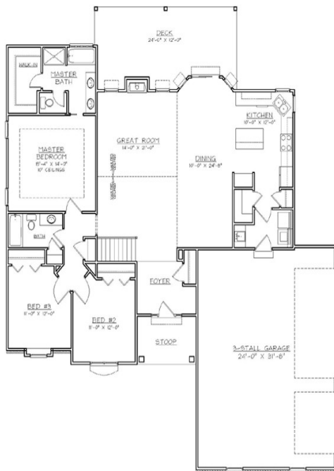
MAIN FLOOR - 1770 Sq. Ft.

The Palmer offers several gathering spaces for family and friends, making this house a warm and inviting home. The natural flow revolves around a variety of living areas: kitchen, dining, deck and great room. Options include a family room and a poured patio on the lower level. A master suite, two additional bedrooms, 1st floor laundry, kitchen pantry, and 3-car garage complete the main floor. Exterior features include cultured stone, brick and pre-finished siding.