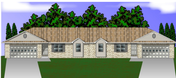
MAIN FLOOR - 1268 Sq. Ft.